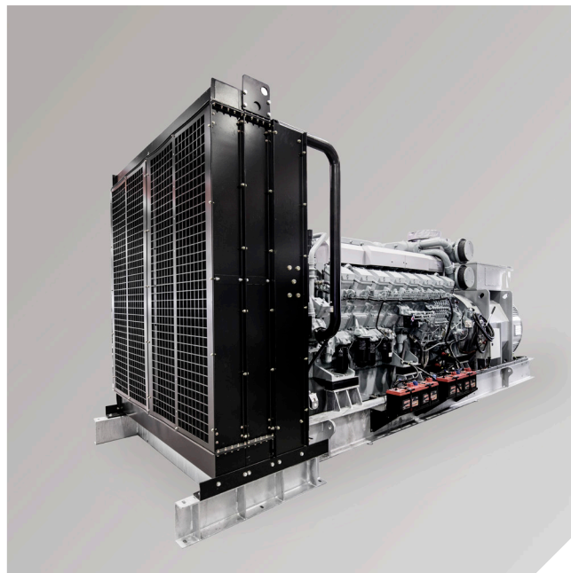
Stationary emergency power generator

Coromatic's emergency power generators are always adapted to the special needs of our customers. This is why we do not purchase complete generators, but instead build them ourselves to achieve correctly dimensioned functionality for motors and generators that we then assemble together with our proprietary portal frames, tanks and other peripheral systems. As an independent supplier, we can always ensure that the specific needs of the customer are what steer the choice of components used, not availability from a single supplier.