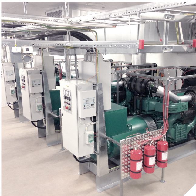
Stationary-installed emergency power system