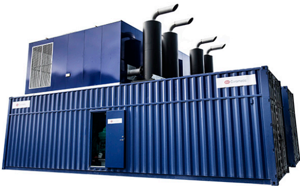
Container-mounted emergency power

Live broadcasts of TV events, filming or major events make particular demands on emergency power, where both low-noise and high capacity must be supplied at the same time in order not to spoil or impact on the audience experience. Coromatic offers Golden Silence, which is adapted to meet these specific requirements, with a sound level of only 61 to 63 dBA and up to 700 kVA prime power. We can also provide our generators from the Movie Super Silent series, where the sound level is an exceptionally low 56 dBA within a radius of three meters.